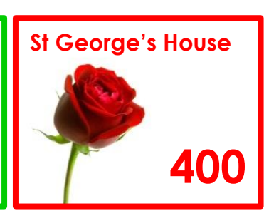
One week to go! Who will be the Term 3 champions?