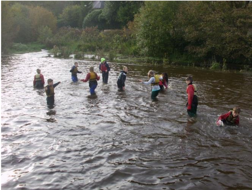
Where are the canoes?