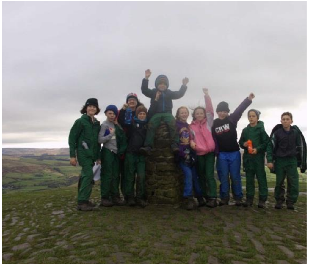
Summit of Mam Tor (Shivering Mountain)